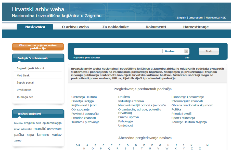
Figure 1: Homepage of the Croatian Web Archive

Up to 2010 the content of the HAW was integrated in the Library’s website. Based on research, surveys and practices it was concluded that users had difficulties in finding information about the HAW and often mistook it for digitized materials. At the end of 2010 the new HAW website was finished with a lot of information, documents and a new range of functions [4]. The new website enabled full text search by title, URL and keywords, browse by subject areas and browse by alphabetically sorted titles. In addition, new search terms in the form of tag cloud and a list of the last five archived resources have been added (Figure 1).