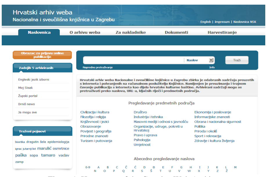
Figure 1: Homepage of the Croatian Web Archive

Up to 2010 the content of the HAW was integrated in the Library's website. Based on research, surveys and practices it was concluded that users had difficulties in finding information about the HAW and often mistook it for digitized materials. At the end of 2010 the new HAW website was finished with a lot of information, documents and a new range of functions [4]. The new website enabled full text search by title, URL and keywords, browse by subject areas and browse by alphabetically sorted titles. In addition, new search terms in the form of tag cloud and a list of the last five archived resources have been added (Figure 1).