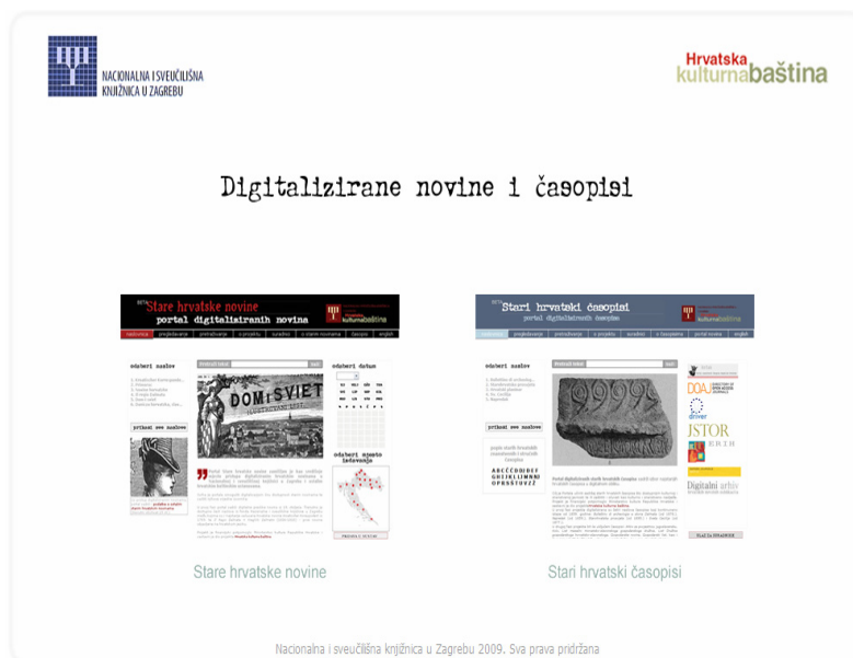
Fig. 1 Digitised Croatian Historic Newspapers and Journals

The portal was launched in 2010 when it was made available to the public on the web site of the National and University Library in Zagreb ( http://dnc.nsk.hr ).