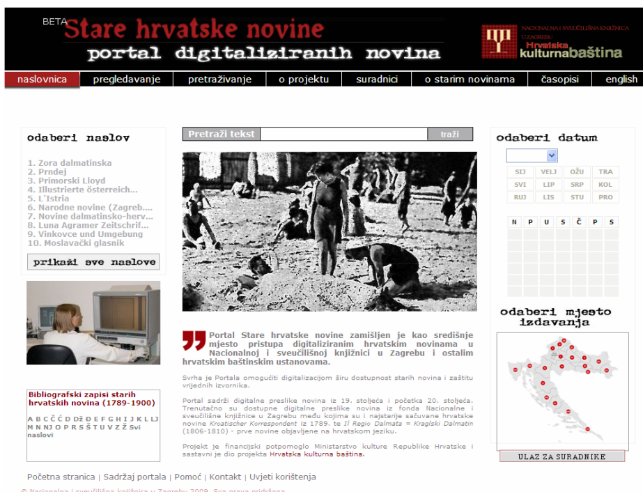
Fig. 2 Digitised newspapers – title page