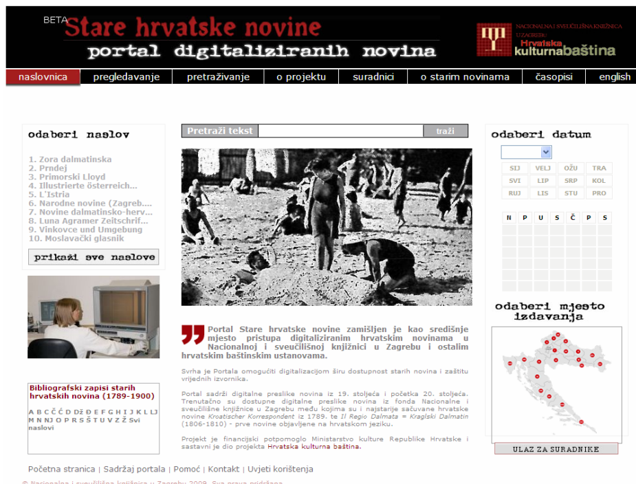
Fig. 2 Digitised newspapers – title page