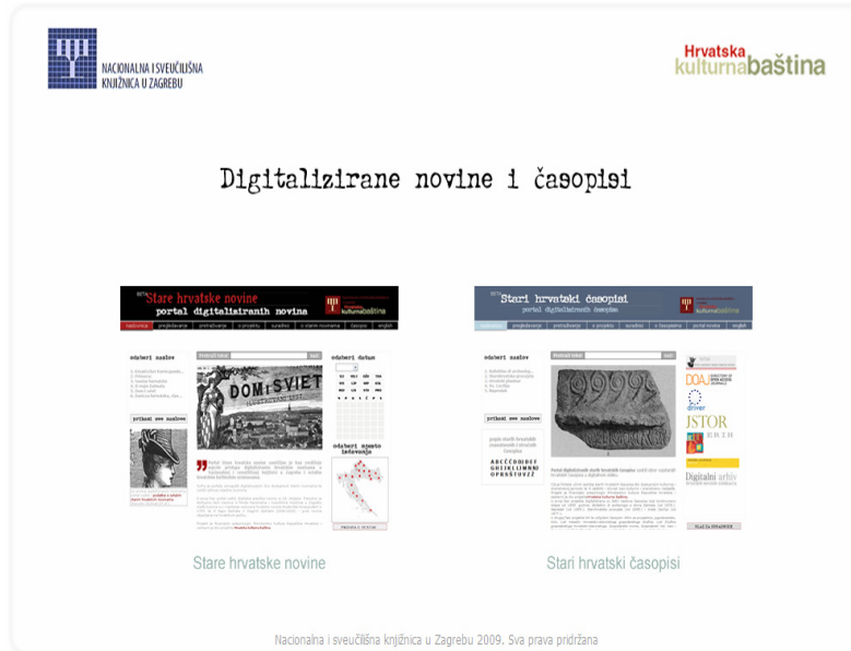
Fig. 1 Digitised Croatian Historic Newspapers and Journals

The portal was launched in 2010 when it was made available to the public on the web site of the National and University Library in Zagreb ( http://dnc.nsk.hr ).